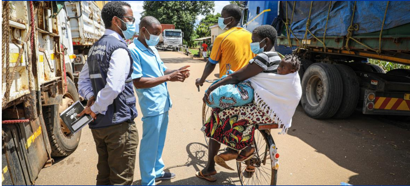
Polio vaccination campaign in Malawi.