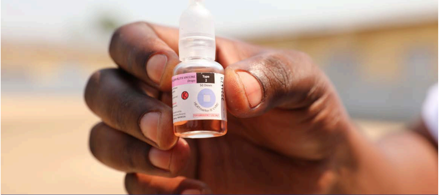
A health worker holds a vial of nOPV2.