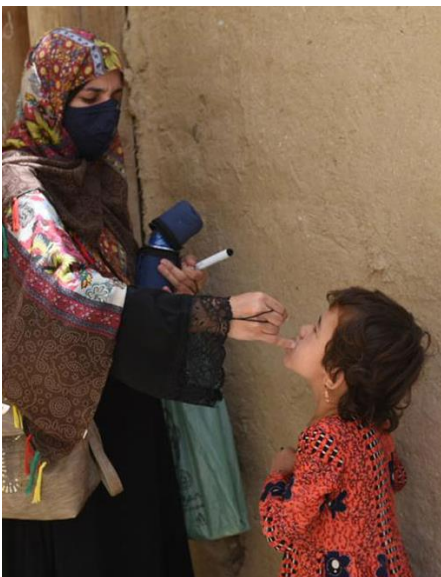
A health worker delivers polio vaccines in Pakistan.

Pakistan is on a mission to end polio, but a sudden surge in cases has alarmed those fighting for eradication. In collaboration with Rotary, Pakistan's polio programme is working closely with the national government to better reach high-risk populations and build community trust to improve vaccine acceptance. The key to eradication? Keeping vaccination coverage rates high amid flooding and other persistent challenges. [More]