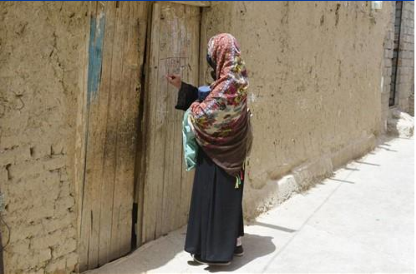
A woman health worker goes door to door to vaccinate children in Pakistan against polio.