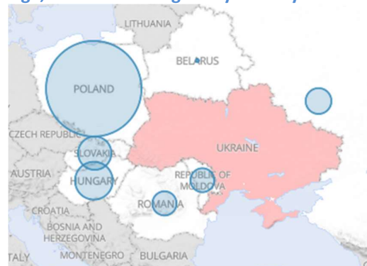
Fig2, Volume of refugees by country

Neighboring countries are ready to offer vaccination to Ukrainians who are staying on their territory and who are passing through their territory. Many refugees resist vaccination, as they don't want to get extra doses but have no proof of their vaccination. Neighboring countries are interested in having vaccination records. E-health can provide only aggregated data from the national database. UPHC and national health system are working with provincial databases and individual providers on ensuring that on requests for proof of vaccination there is communication back to requesting parties via photocopies or election methods.