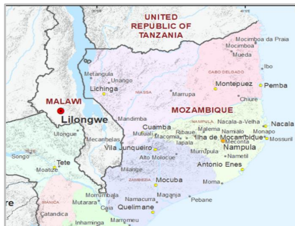
Fig 1: Distribution of WPV1 case in Malawi