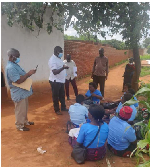
Fig. 2.: Ongoing Community Surveillance