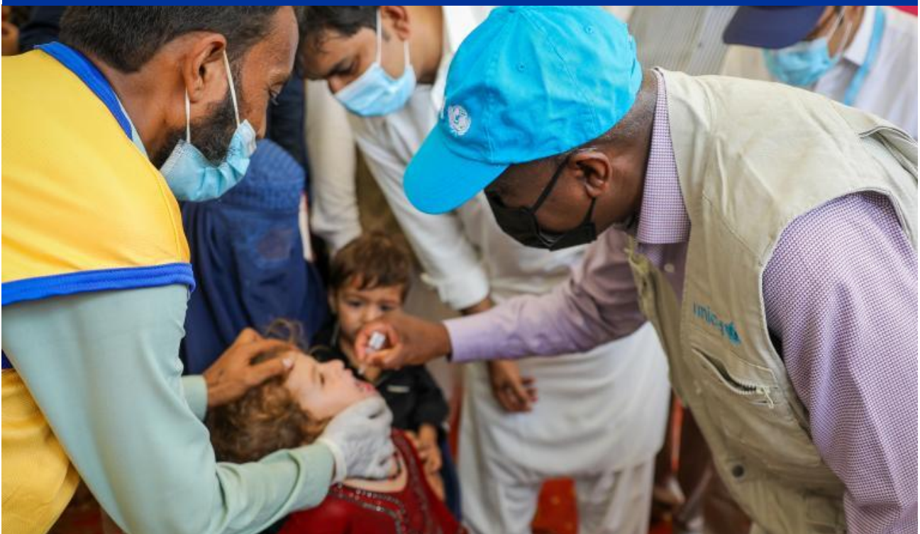
A child receives the polio vaccine during programme leadership's visit to Pakistan in June.