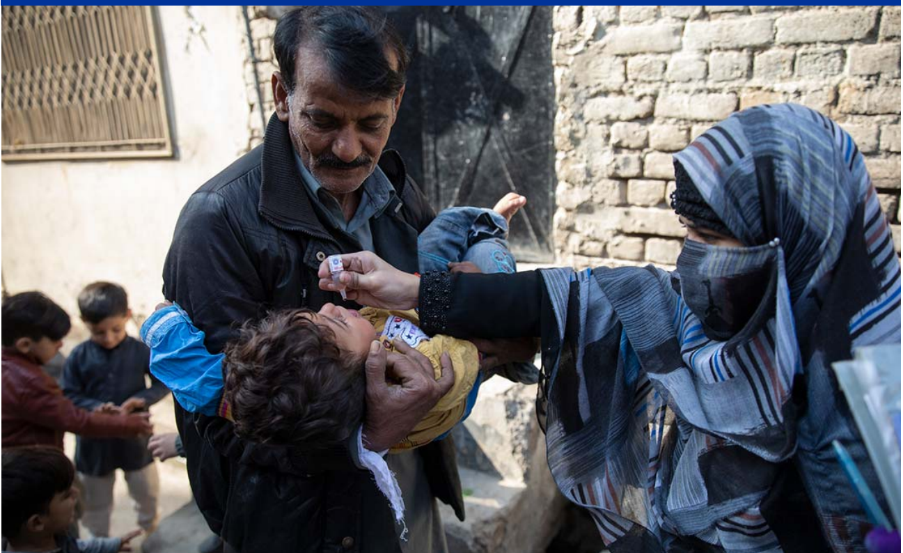
A health-worker vaccinates a child against polio in Fauji Colony, a high-risk part of Rawalpindi.