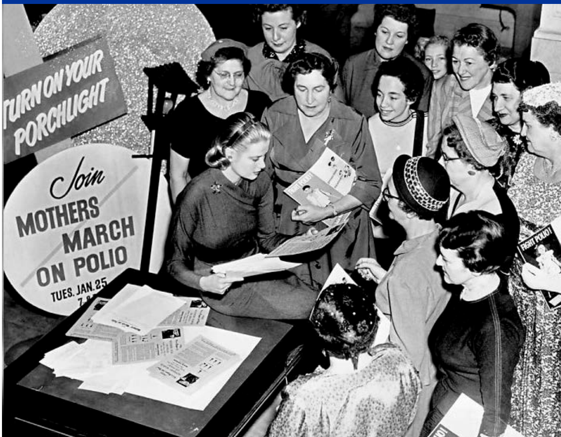
Actress Grace Kelly distributed March of Dimes literature to leaders of the Mothers' march on Polio.