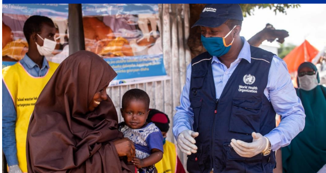
The Regional Polio Eradication Officer for Banadir, Somalia, participates in an integrated immunization campaign held in September 2020 with strict COVID-19 safety measures in place.

The Polio Research Committee is calling for research proposals supporting the strategic plan [ More ]