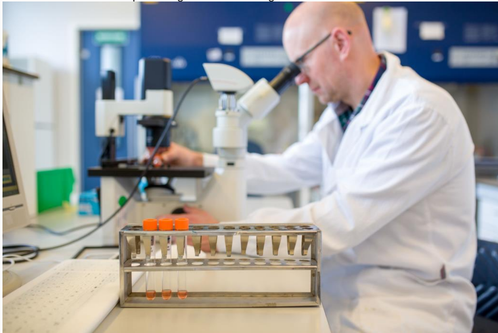
A polio laboratory specialist at work in the Netherlands.