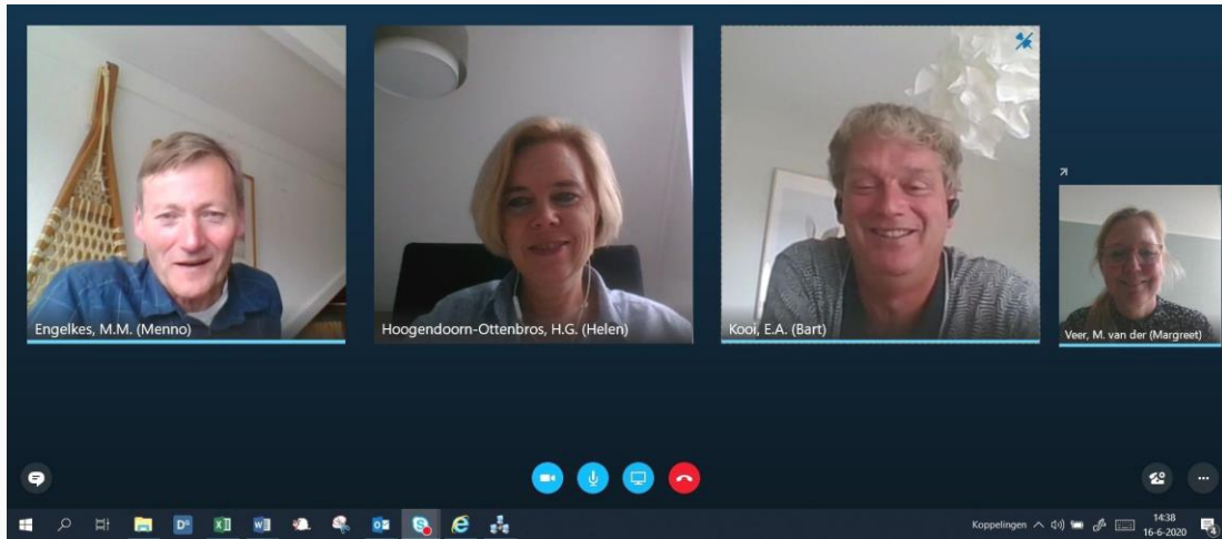
Team NAC Netherlands practicing social distancing.

and the NAC will continue to support our facilities throughout the process.