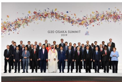
Leaders at the G20 Osaka Summit 2019

G20 Leaders met in Osaka, Japan, to discuss major challenges facing the world, including the ongoing fight to end polio. The G20 Osaka Leaders’ Declaration “reaffirmed commitment to eradicate polio,” with a powerful global health