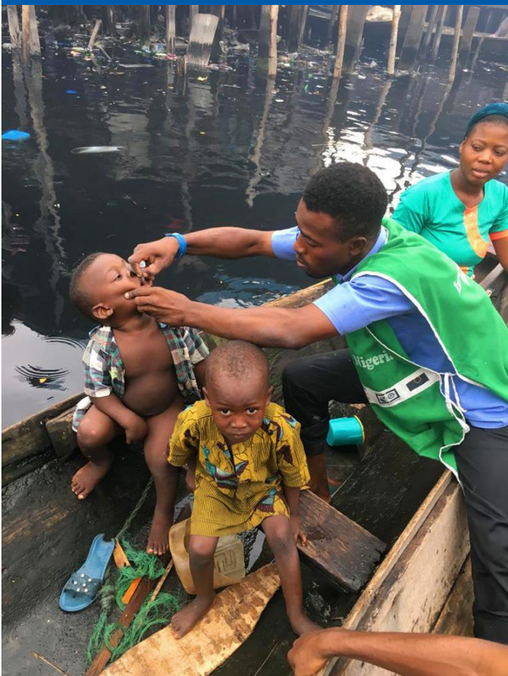
To reach every child, health workers in Makoko, Nigeria take any available opportunity to vaccinate children against polio – even on boats as families ferry across the village.