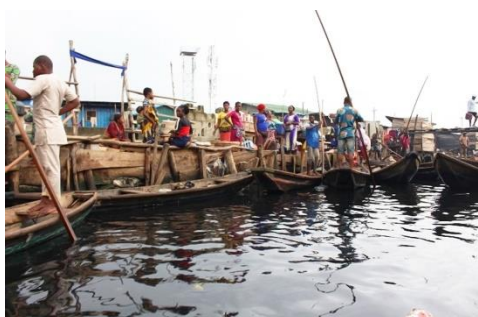
Makoko is a floating water world on the coast of Lagos, Nigeria.

In Makoko, a sprawling river town in Nigeria, Peter Idowu helps health workers navigate complex waterways, language barriers and vaccine refusals to protect local children against polio. Read more about Peter’s role as one