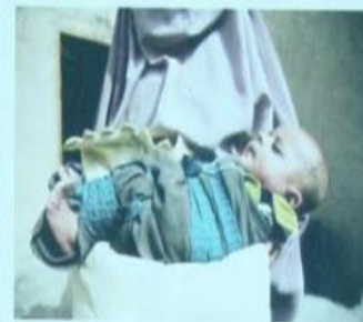
This little boy is sleeping when vaccinators arrive at his house, and he is lucky they are female, otherwise he might have missed the vaccine. Men are not allowed inside a private house unless they are immediate family members. This is why female polio workers are so critical. Over 35% of community

bags, or play in the sand. They encouraged me to stay in the health center. My dream is to become a