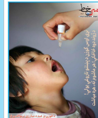
د کوزون پر ضد د مبارزې لوبواله ورځ

bags, or play in the sand. They encouraged me to stay in the health center. My dream is to become a