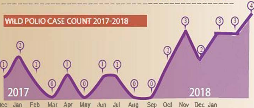
WILD POLIO CASE COUNT 2017-2018

Legend ● Cases in 2018 ● Cases in March 2018