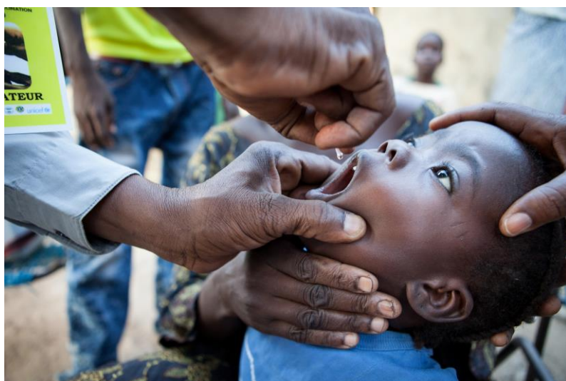
116 children were vaccinated across 13 countries in just four days.

One of the largest synchronised vaccination campaigns in Africa took place on 25-28 March, aiming to reach 116 million children with polio vaccines. Close to 200,000 health workers worked tirelessly over the four days to vaccinate children in 13 countries across Central and West Africa. The campaign is part of an urgent effort to stop polio on the continent following the outbreak in Nigeria in 2016. [Read more]