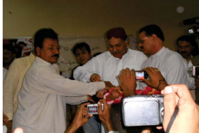
Speaker Assembly Balochistan inaugurating SNIDs September 2012